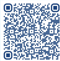
I-9 case study